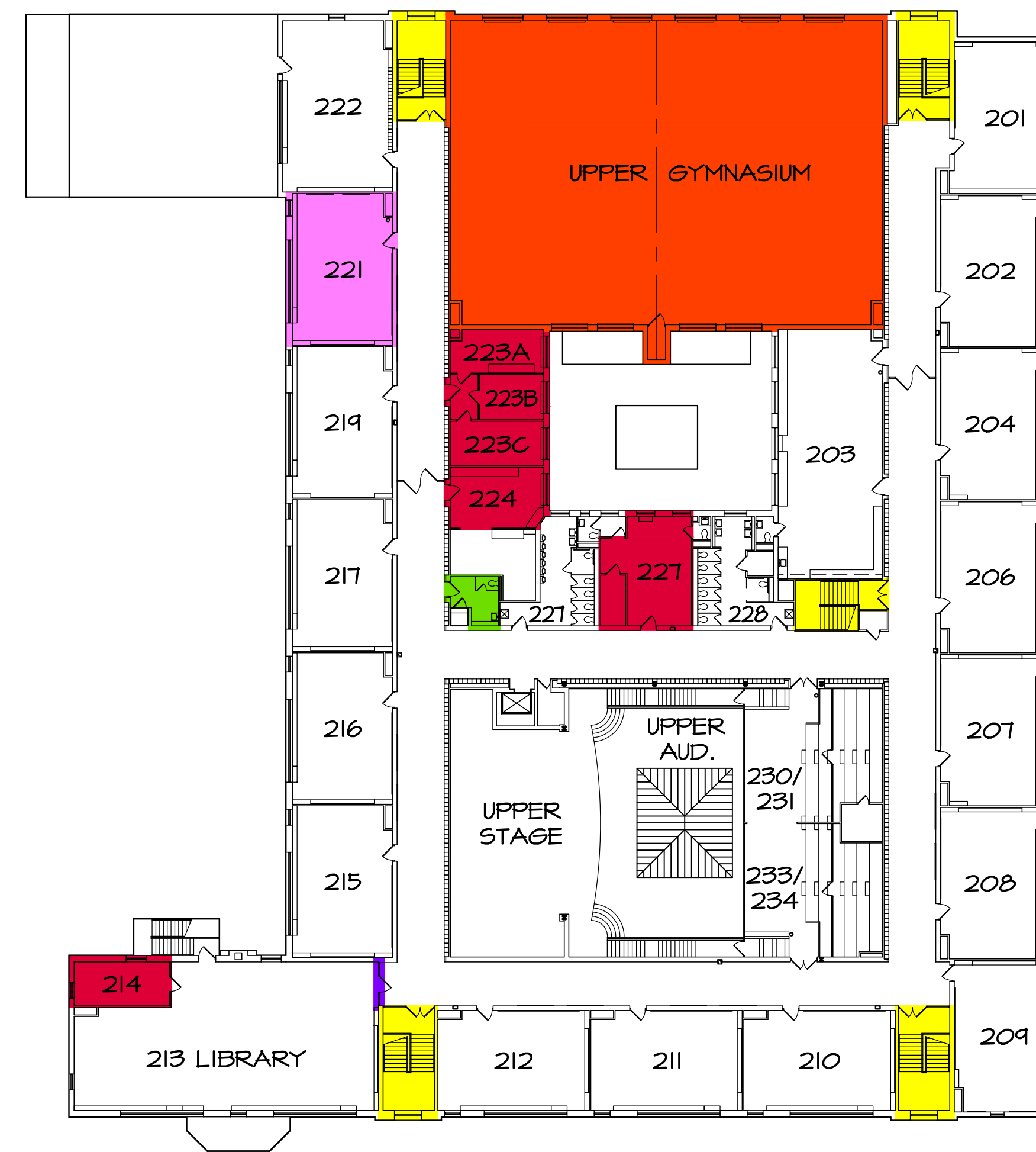
SECOND FLOOR PLAN (Boiler House not shown)